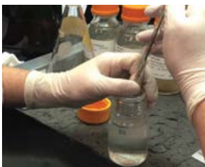
4 Technician filtering sample through solid phase extraction disk per EPA Method 1664B