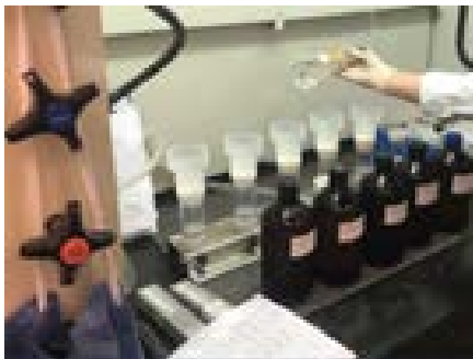
1 Preparing the solid phase extraction filter

The EPA requires that the Method 1664 be used for certain samples but leaves laboratories free to use an alternate method for the vast majority of samples. "We felt the gravimetric method was highly dated and that it required too much time, solvent and manpower," related the Lab Manager. "We looked at alternatives and discovered infrared technology." The InfraCal HATR-12 is recommended for measuring oil and water, total petroleum hydrocarbons (TPH) in soil or FOG in wastewater with hexane, pentane or Vertrel MCA as the extracting solvent. The instrument is designed to correlate with EPA Method 1664B. It measures extracted hydrocarbons by passing infrared right through the sample. The hydrocarbons absorb infrared energy at a specific wavelength proportional to the concentration of oil and grease in the solvent. The analyzer can be calibrated to read out directly in the desired units.