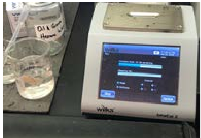
4 Zeroing the infrared analyzer