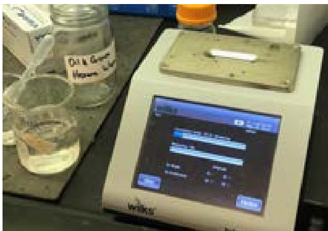
3 Timer countdown until reading is provided