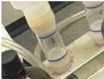
2 Collection tube for hexane extract