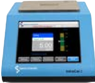
InfraCal 2 ATR-SP

The lab manager concluded that the overriding benefits of the new instrument are time and cost savings. “The infrared analyzer provides results in 10 minutes start to finish compared to 24 hours for EPA Method 1664B,”. “This improvement makes it possible for our analysts to accomplish more in less time with the result that we have been able to accommodate an increasing work-flow without increasing our laboratory headcount. The 90% savings in solvent costs have also provided significant cost savings. The fact that the infrared analyzer provides results one day faster than EPA Method 1664 gives our organization a head start in reacting to FOG discharges. All in all, infrared measurements enable us to do a better job of preventing sanitary sewer overflows at a lower cost.”