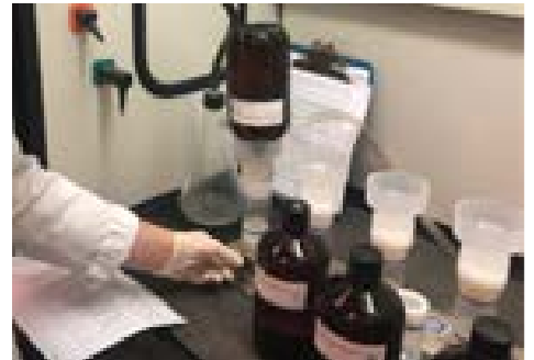
3 Pouring hexane through filter