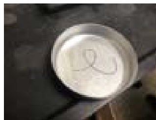
6 Oil and grease residue after evaporation in fume hood