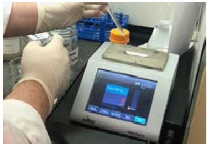
2 Transferring sample onto instrument sample plate