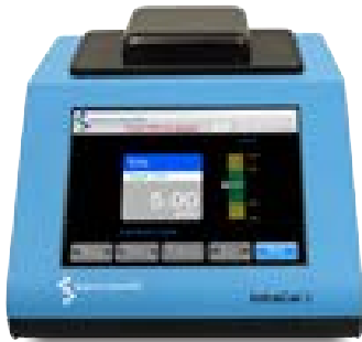
InfraCal 2 TRANS-SP