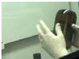
5 Rinsing sample bottle with hexane