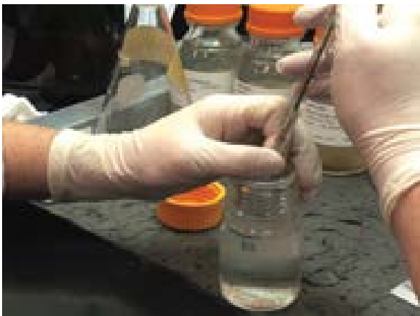
1 Removing 60 microliters of sample from hexane layer

The analyst tested several industry composite samples using 250 mL of sample and 25 mL of hexane. Replicate results for these samples were very accurate as well. The first was a concentrated audit Quality Control (QC) from the EPA with a given concentration of 159 ppm. The analyst mixed 1 mL of the QC concentrate with 99 mL of DI water and 10 mLs of hexane. The infrared instrument provided readings of 163, 150 and 165 ppm. A second test on the same sample provided one result that was unexpectedly high. The analyst noted that the instrument had been provided with instructions that it be re-zeroed every hour of use, and he had been using it for several hours without re-zeroing. He re-zeroed the instrument and got satisfactory results of 165, 143 and 159 ppm.