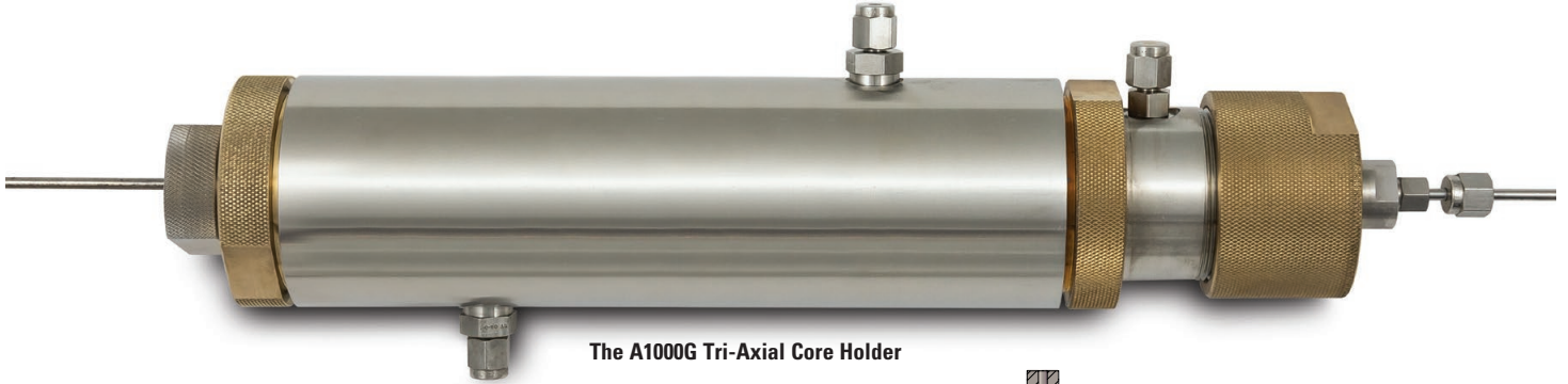
The A1000G Tri-Axial Core Holder