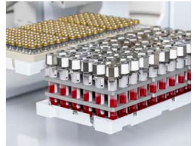
Table 1: Applications supported by clinPAL

Automation of sample preparation, handling, and introduction minimizes personnel working hours and manual work, increasing profitability, reproducibility, and accuracy.