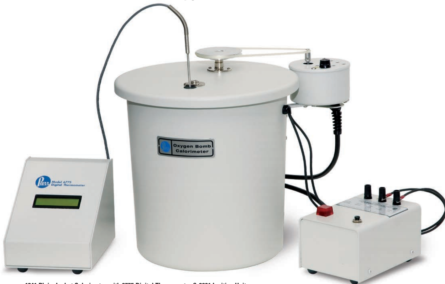
1341 Plain Jacket Calorimeter with 6775 Digital Thermometer & 2901 Ignition Unit